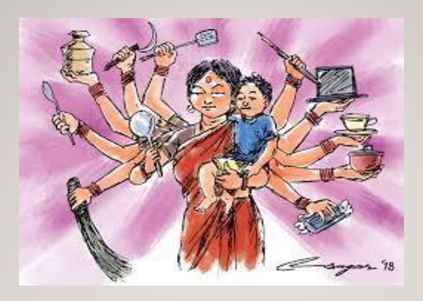
"With our different challenges, we must remember that it is together that we make history." - Unknown